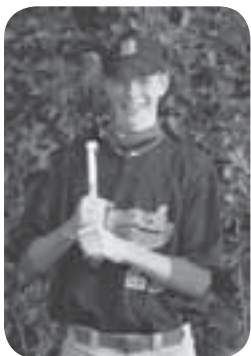
Carson Wentz #20